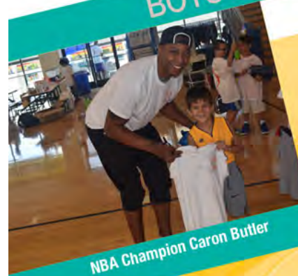
NBA Champion Caron Butler

BOYS & GIRLS ENTERING 2ND-8TH GRADE IN THE WEINBERG & RICKLES GYMS